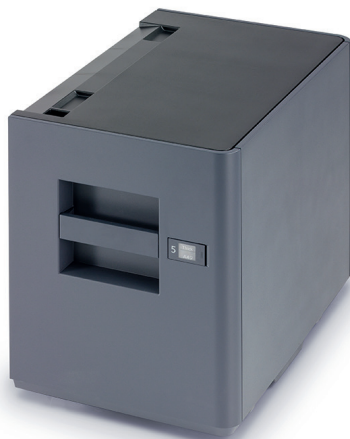
3,000-SHEET PAPER FEEDER PF-7120 Ideal for large print runs in A4.