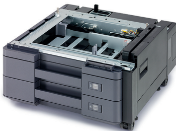
2X 500-SHEET PAPER FEEDER PF-7100 Ideal for paper sizes between A6 and SRA3 (320 x 450 mm).