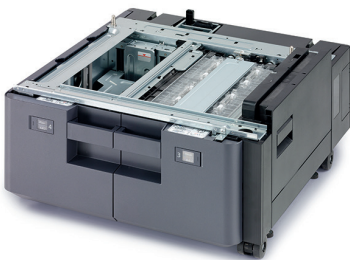
2X 1,500-SHEET PAPER FEEDER PF-7110 Supports A4, B5 and letter formats.